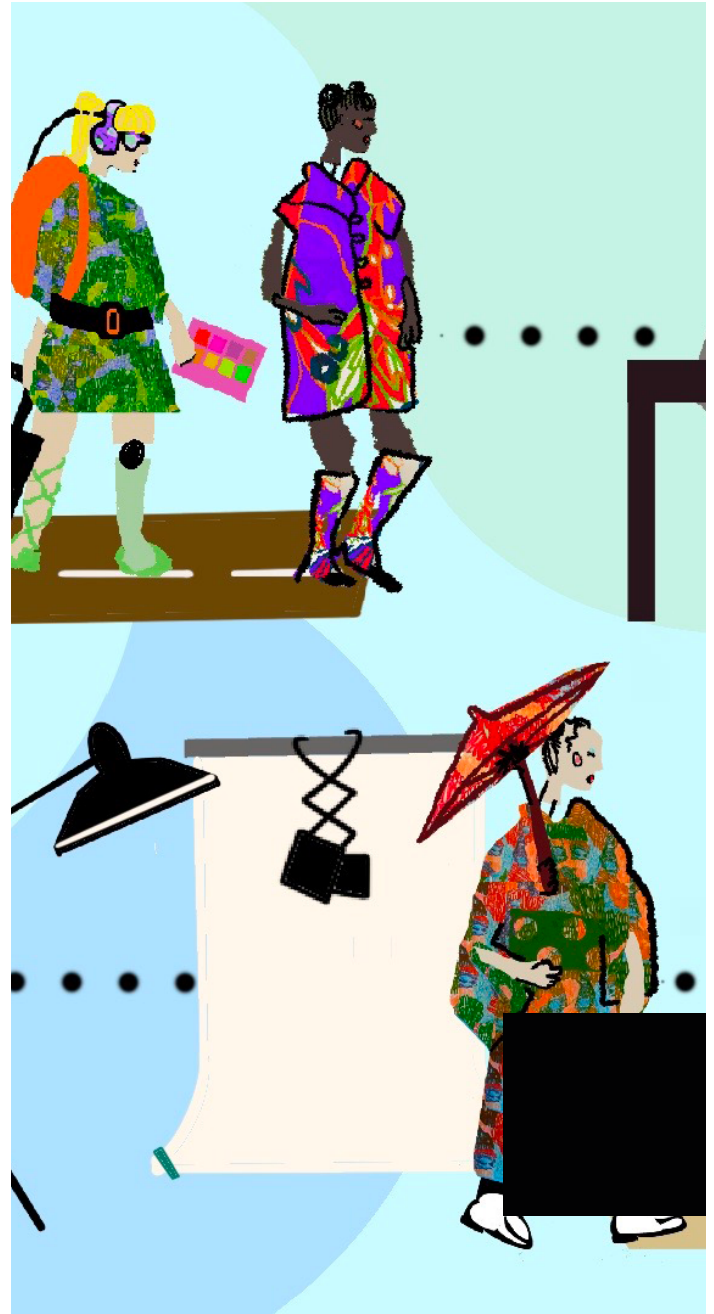
Illustration by Priscilla Fung