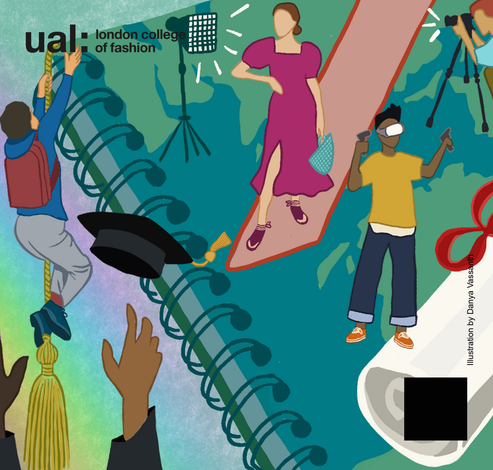
Illustration by Danya Vassanth